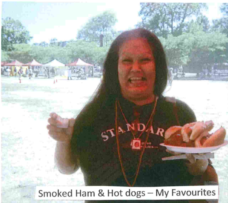
Smoked Ham & Hot dogs – My Favourites