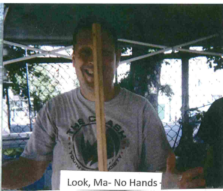
Look, Ma- No Hands -